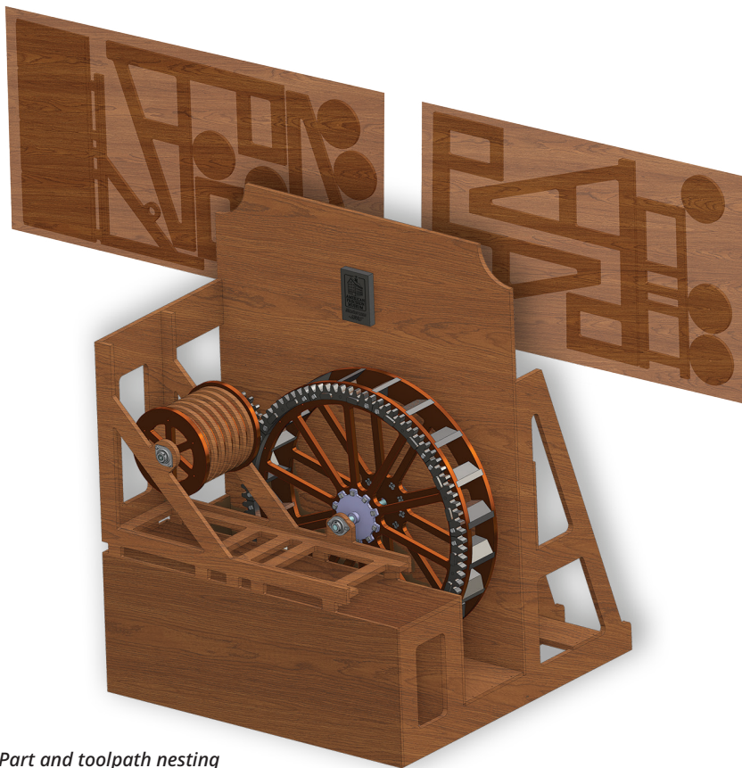
Part and toolpath nesting increase project yields and profitability.